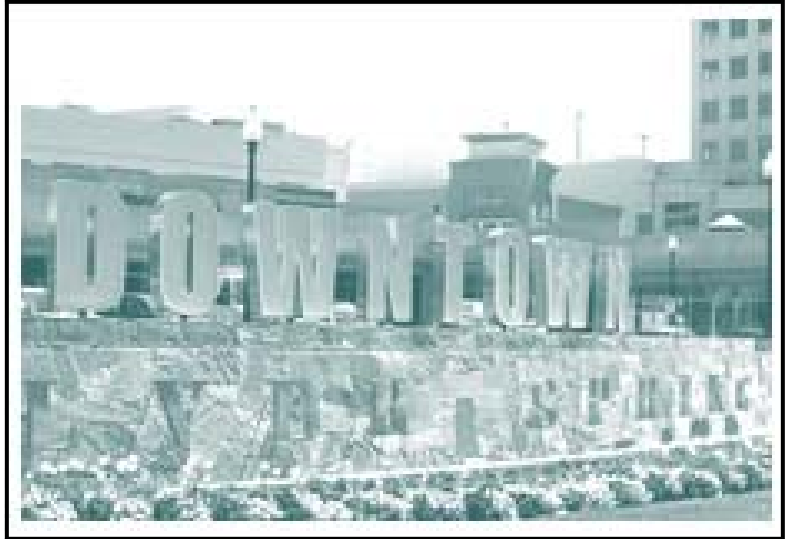
Downtown Silver Spring embraces and welcomes all.

Our presence in the DOWNTOWN area is reflective of the entire community's desire to be a PLACE for all people, a place where all can live and work in harmony with the environment and with each other, a place where diversity is encouraged and celebrated: where rich and poor and middle class, young and old, singles and families, where