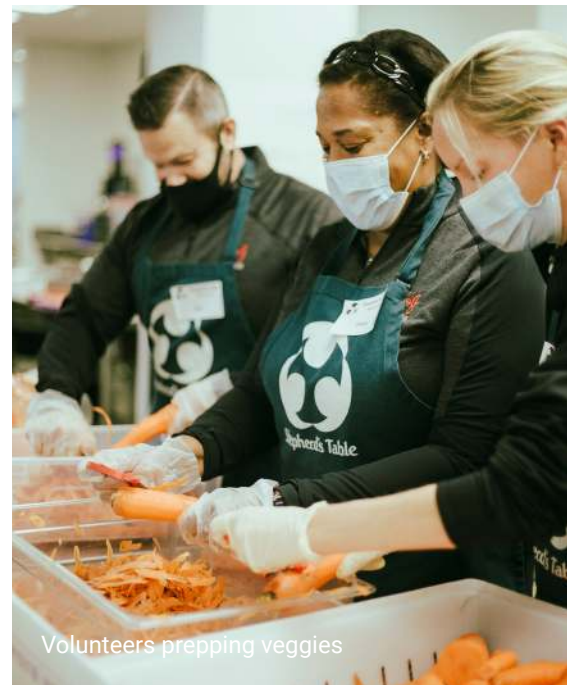
Volunteers prepping veggies