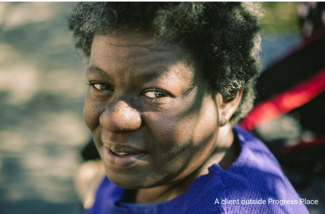
A client outside Progress Place

8106 Georgia Ave Silver Spring, MD 20910 (301) 585-6463 info@shepherdstable.org