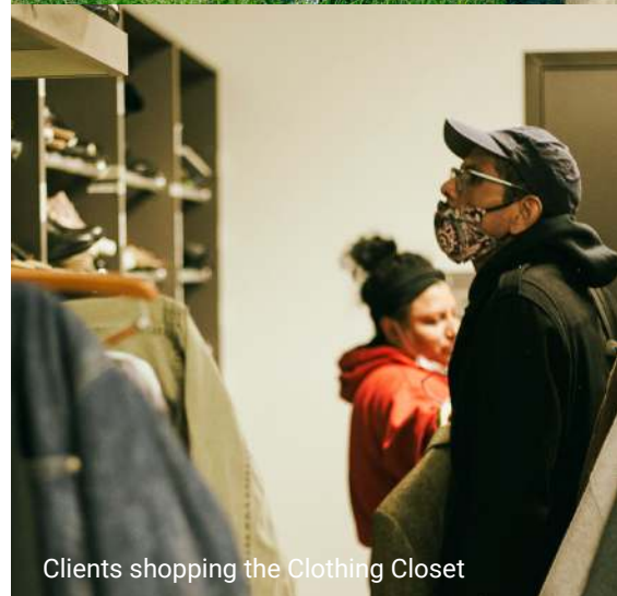
Clients shopping the Clothing Closet