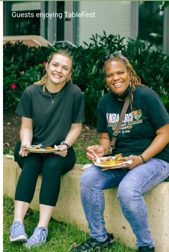
Guests enjoying TableFest